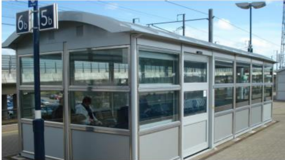
Platform Waiting Room